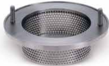
Square hole high shear screen™