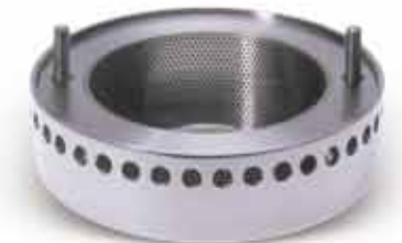
Standard emulsor head and emulsor screen