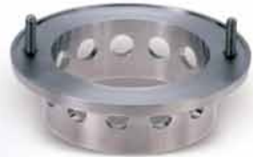
General purpose disintegrating head

The machines are in most cases self-cleaning, a short run between successive operations in water, detergent or an appropriate solvent being all that is necessary. For more thorough cleaning, dismantling is easy and downtime minimal.