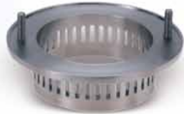
Slotted disintegrating head